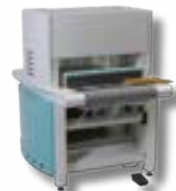
Tc2 Loom Digital Weaver