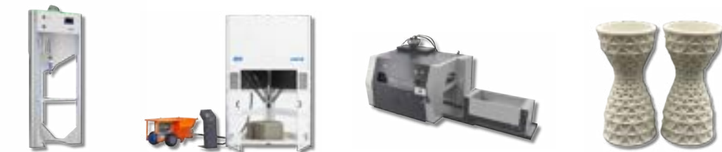
Wasp Delta Wasp Concrete Ex-one Sand Printer Tethon Ceramic