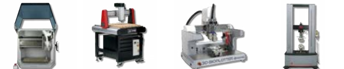
Makera Carvera CNC Axiom CNC Envision Tec BioPlotter Universal Testing Machine