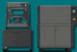
Desktop metal studio system