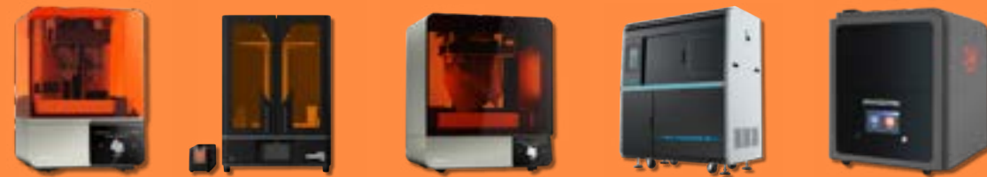
Formlabs Form 4 Phrozen Mega 8kV2 Formlabs Form 4L Flahsforge Waxjet 510 EnvisionTEC D4K