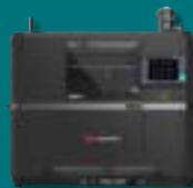
Metal Binder Jetting System