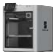
Bambulab X1 Series