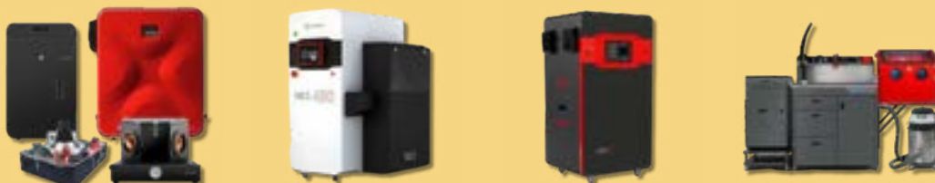
Sinterit Lisa Sinterit NILS 480 Sinterit Lisa X Sinterit Lisa Professional