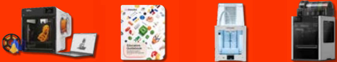
MakerBot Sprint MakerBot Education Ultimaker 2+ Connect Bambu lab H2D