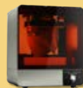
Formlabs Form 4L