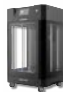
Flashforge Guider 3 Plus