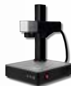
ProMark Fiber Laser