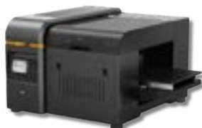
Artisjet Artis 3000U