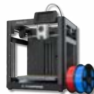
Flashforge Adventurer 5m