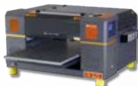
Artisjet Artis 5000U