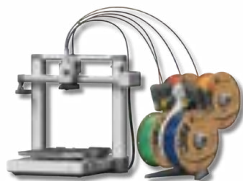
Bambulab A1/P1 Series