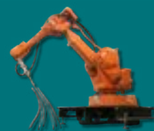
Direct Energy Metal 3D Printer (DED)