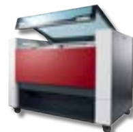
Trotec Speedy Series