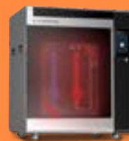
Flashforge Creator 4