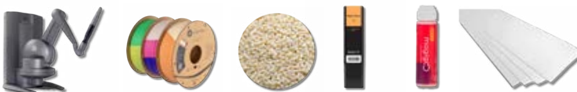
Geomagic Freeform Touch X Filaments Pellets Resins Adhesives Sheets