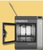
Intamsys FunMat HT