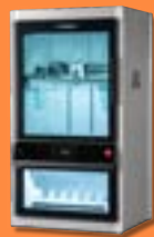
Ultimaker Factor 4