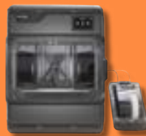
Ultimaker Method XL