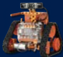
Weemake 6in1 Robot