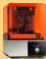
Formlabs Form 4B